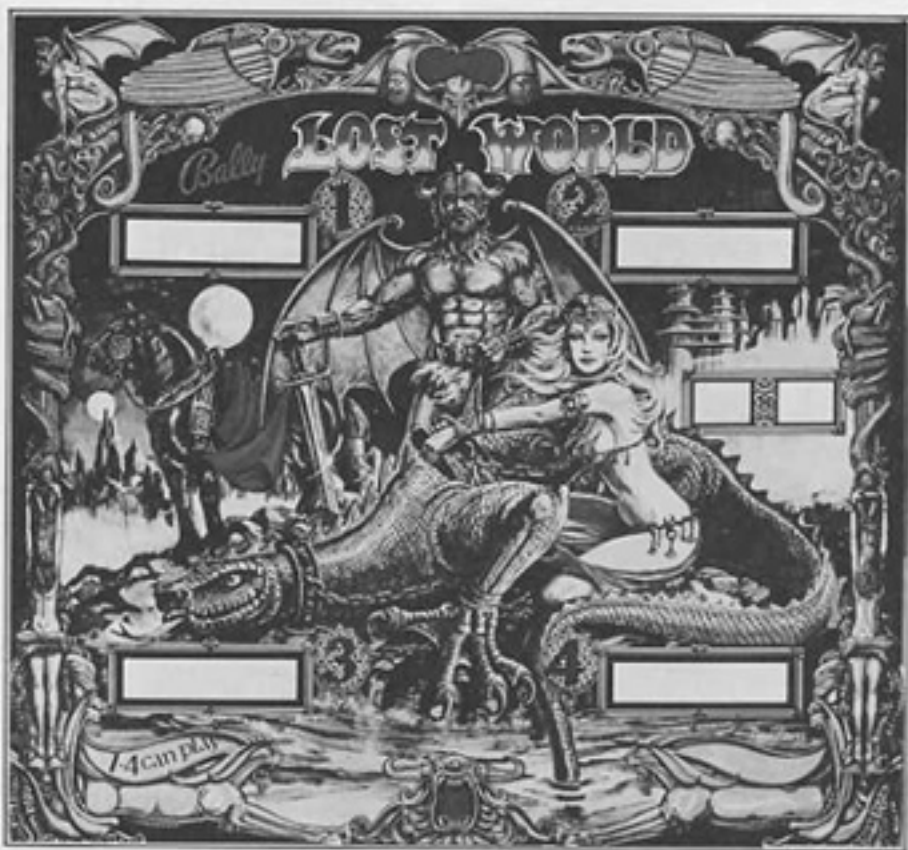
BACK GLASS G-408-27

WHEN ORDERING PART, SPECIFY PART NO. AND NAME OF GAME