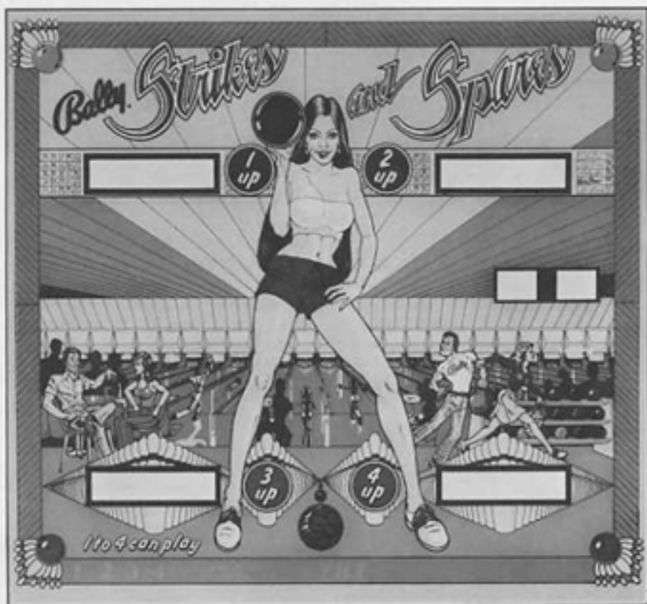
BACK GLASS G-408-31

WHEN ORDERING PART, SPECIFY PART NO. AND NAME OF GAME